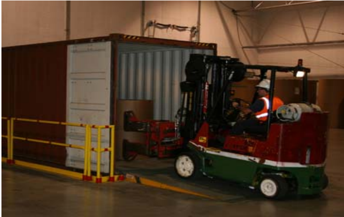
Product taken from warehouse and stuffed into Container