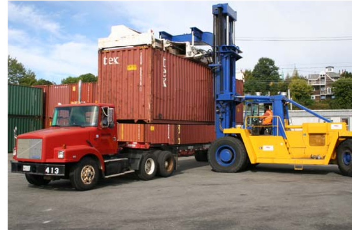
Trucked to nearby container terminal and new empty is returned to warehouse