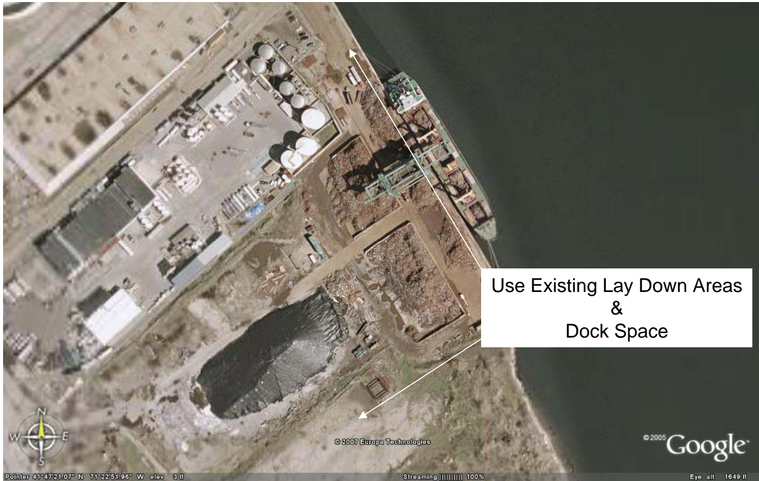
Container terminal at ProvPort