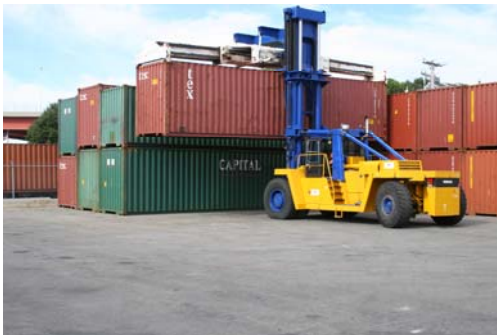
Stacked in yard awaiting Ship