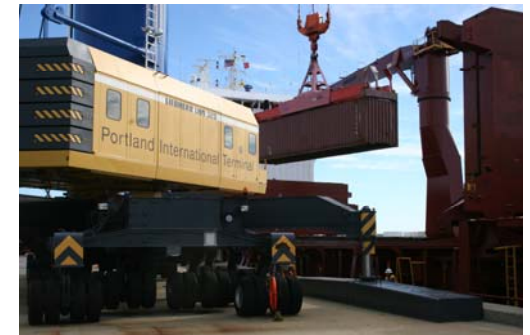
Put onto weekly ship or barge for movement to NYC area terminals