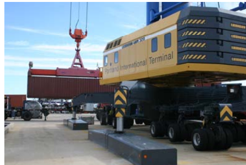
Put back onto truck and moved to dock